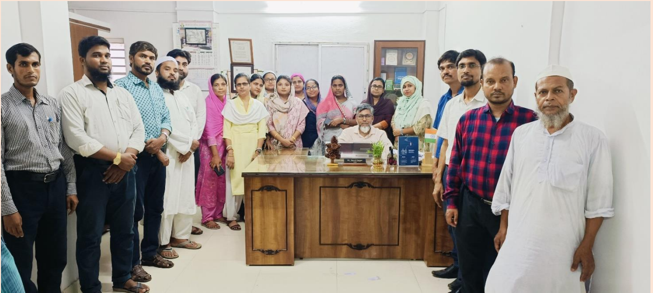
Teaching Faculty of the College