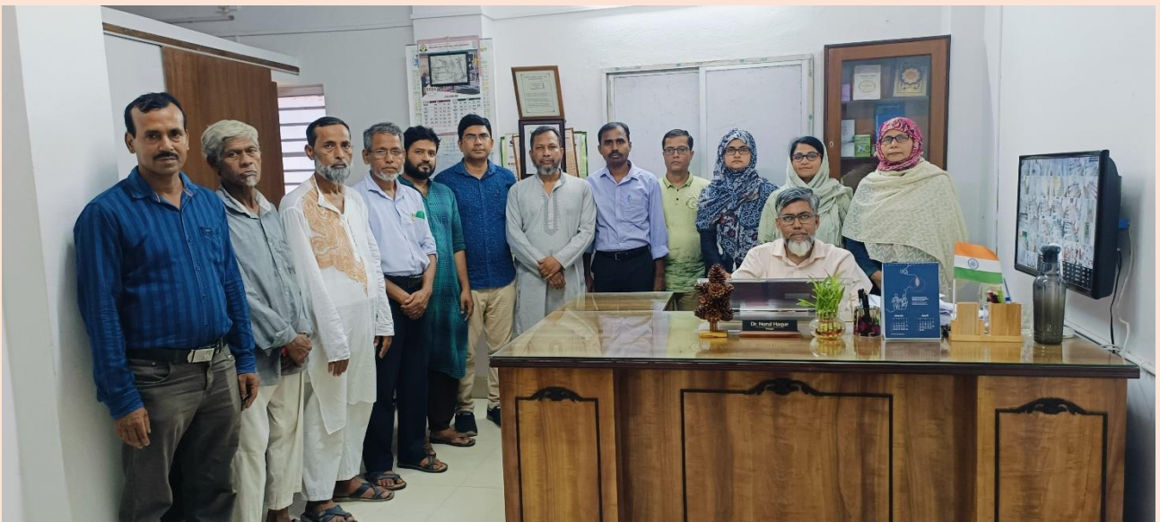
Non-Teaching Staff of the College